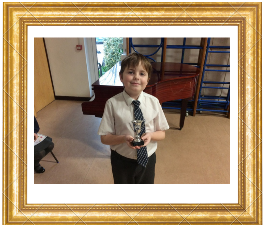
Wonderful Writer goes to Rowan in Seals Class